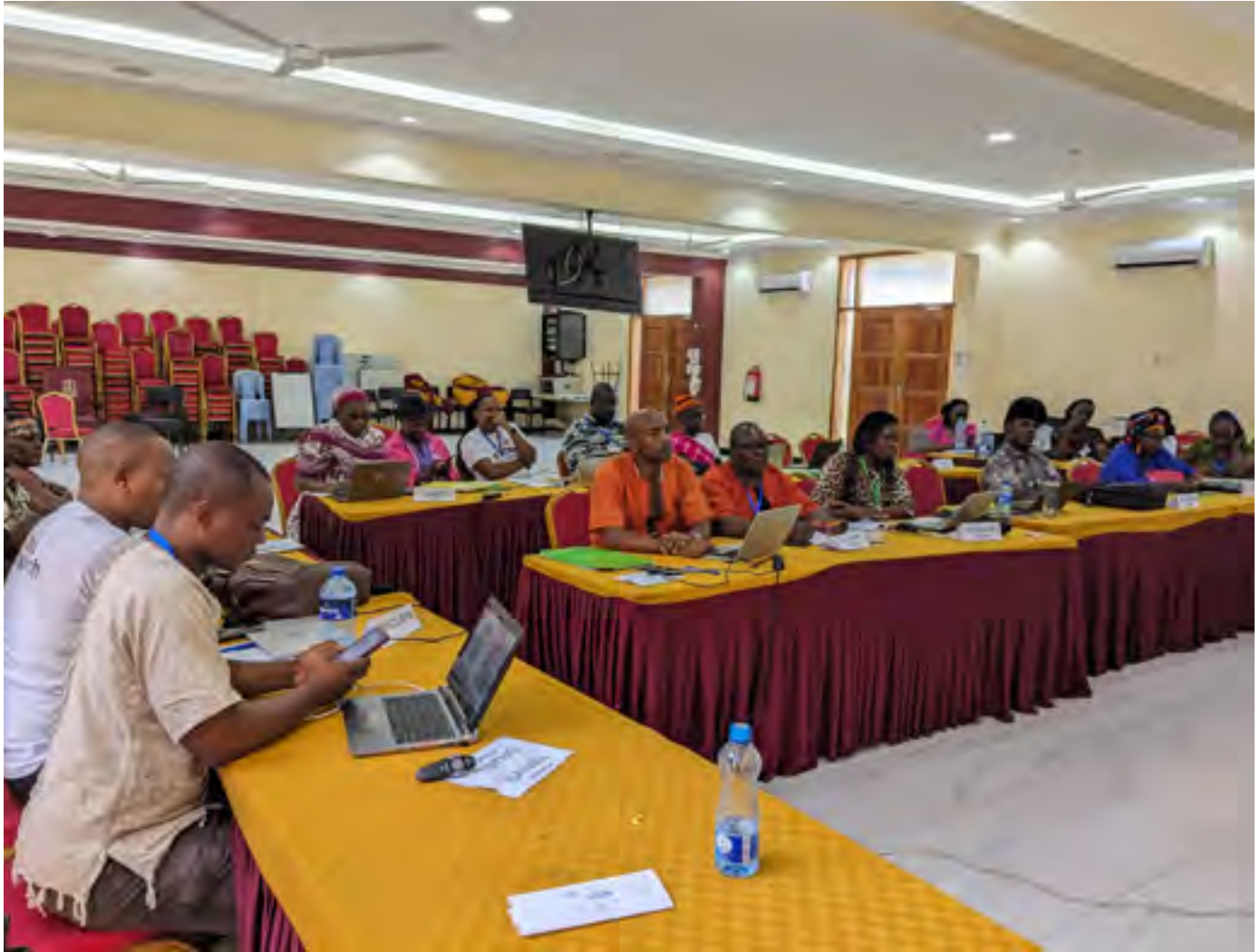
A section of participants during the training [file photo].

T he College in partnership with MicroResearch Canada, has commenced a two-week research training workshop at KMTC Mombasa, running from September 22 nd to October 3 rd , 2025.