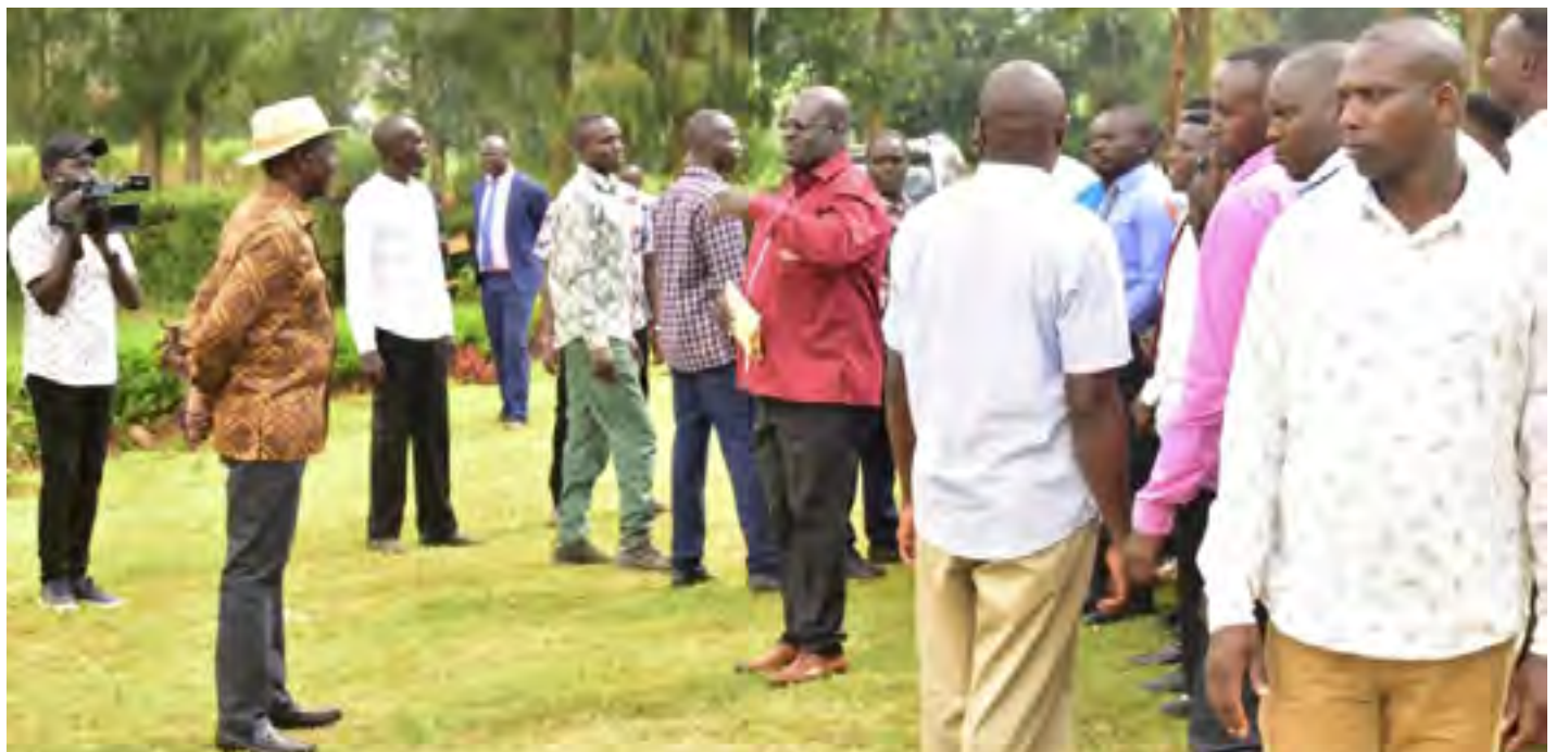
H.E. President William Ruto (left), during his development tour on September 6, 2025, made a stop at KMTC Awendo, where he pledged support for student accommodation through the Affordable Housing Project.