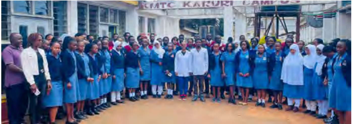
KMTc Karuri staff and new students during orientation.