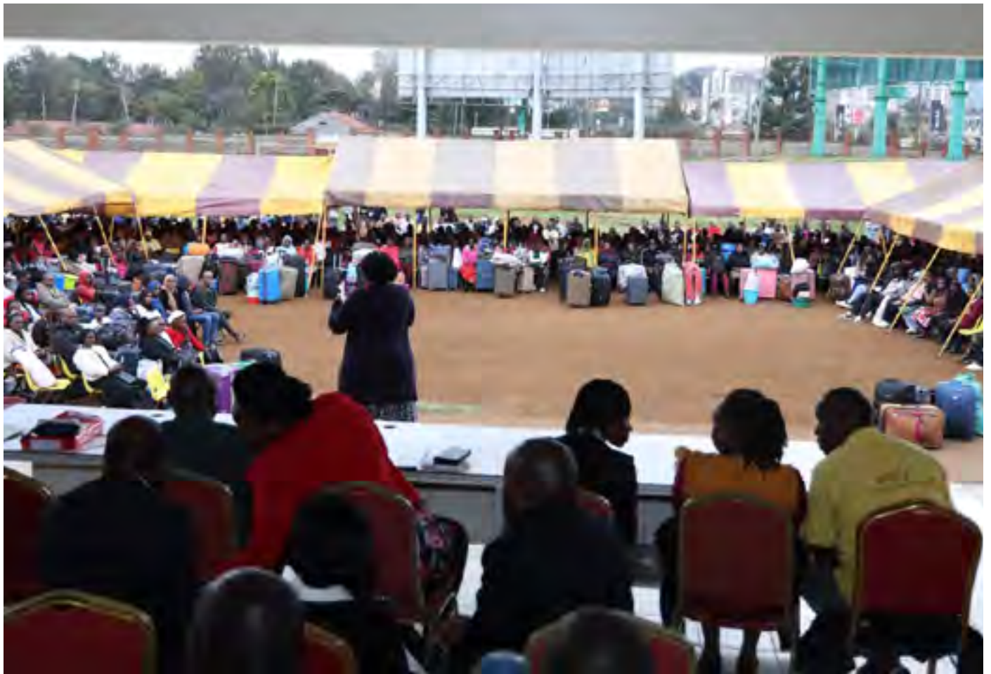
KMTC staff, new students, their parents and guardians on the admission day.