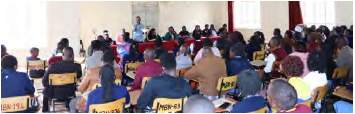
Mbooni Campus - Briefing of new students, their guardians and parents during the September 2025 admissions.