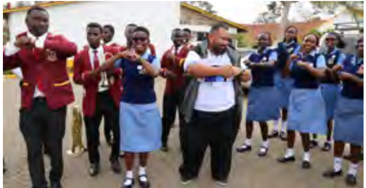
A section of the Nairobi Campus Choir entertains guests during the meeting.