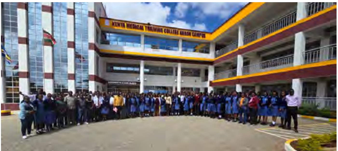
KMTc Narok staff and new students during orientation.