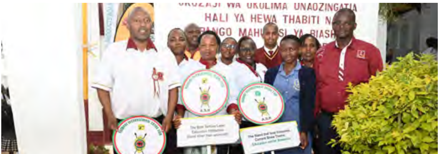
Nairobi Campus demonstrated excellence at the 2025 Nairobi International Trade Fair, securing three major awards: second place in Best Tertiary Education Institution Other Than University (for the fifth consecutive year), third place in Best Stand that Best Interprets the Current Show Theme: Education and/or Research, and second place in Best Display and Services in the Health Sector and Pharmaceuticals Stand.