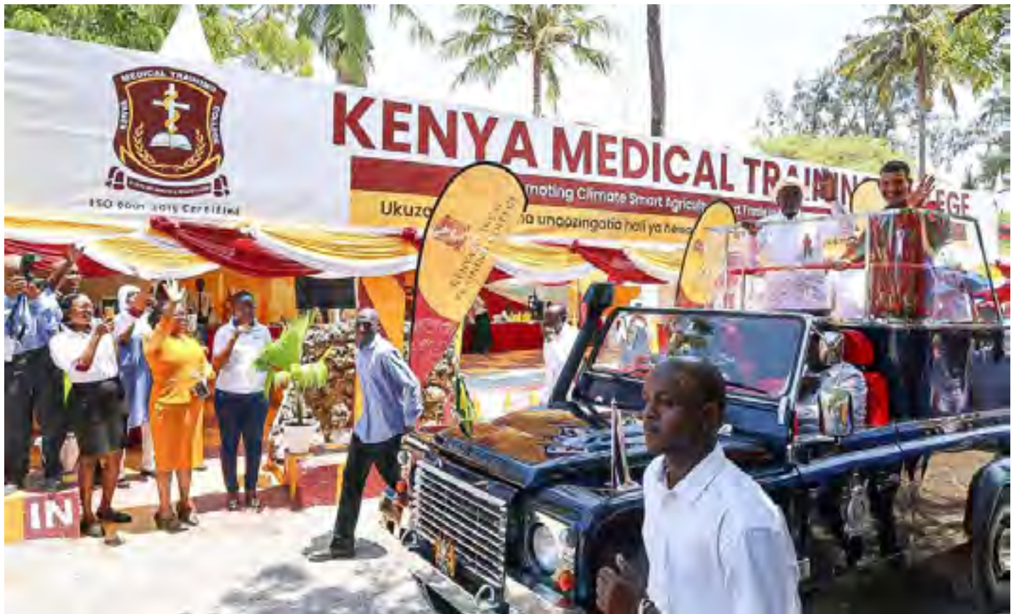
President William Ruto at the Mombasa ASK Show on September 5, 2025, where the College was recognized as the Best Tertiary Level Education Institution Stand other than University and received the award for Best Display and Services in the Health Training Sector and Pharmaceuticals Stand.