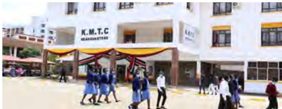
A section of KMTTC Students at the College Headquarters (File photo).

The College on September 9, 2025, announced the award of Johnson & Johnson scholarships to 110 nurses and midwives from across the counties.