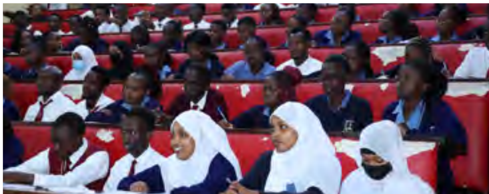
A section of KMTTC Students during the training at Nakuru Campus.

Every graduation gown carries a dream: the dream of a decent job, a secure future, and the dignity that comes with professional success. For many graduates, that dream feels painfully delayed. Days turn into months as they queue at offices with crisp Curriculum Vitae, waiting for opportunities that never arrive, and frustration begins to set in.