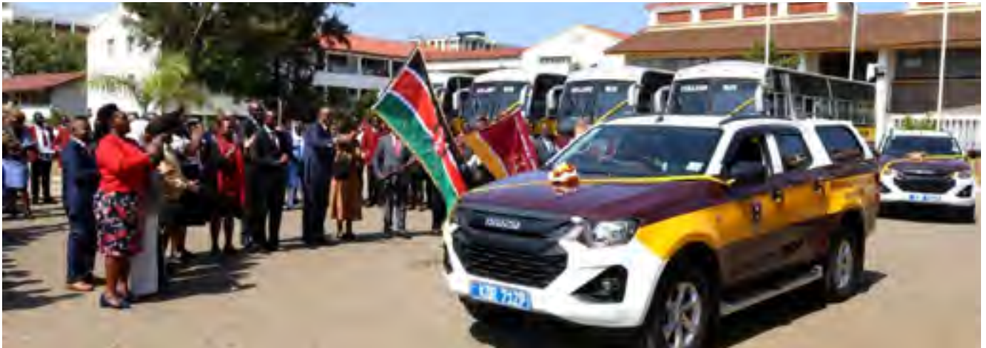
Health CS Hon. Aden Duale flanked by Board Directors, Management team, Staff and students flags off a double cabin pick-up for Ugenya Campus.