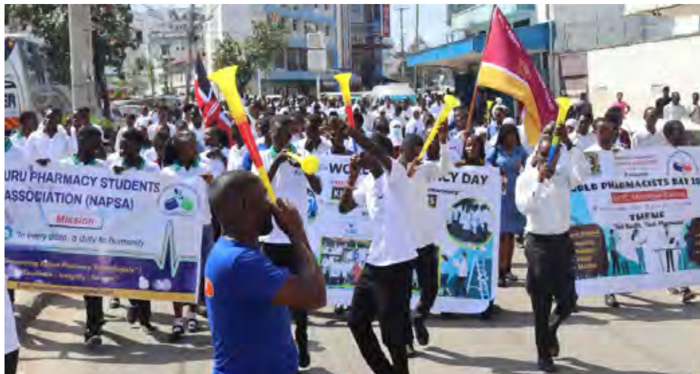
KMTC Students, Staff and Stakeholders during a pharmaceutical awareness walk in Mombasa town.

T he College joined the global community in marking World Pharmacist Day 2025, themed “Think Health, Think Pharmacists,” at KMTC Mombasa Campus on September 25, 2025. The event brought together pharmacists and pharmaceutical technologists from KMTC campuses in Mombasa, Nairobi, Nakuru, and Manza, alongside representatives from Mount Kenya University, Coast General Hospital, and the Kenya Pharmaceutical Association, Coast Branch.