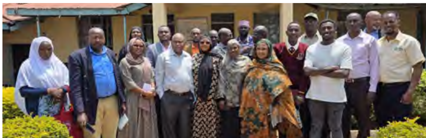
Participants during the meeting.

K MTC Marsabit Campus has been identified as a strategic partner in strengthening community health and tackling pressing social challenges in the region.