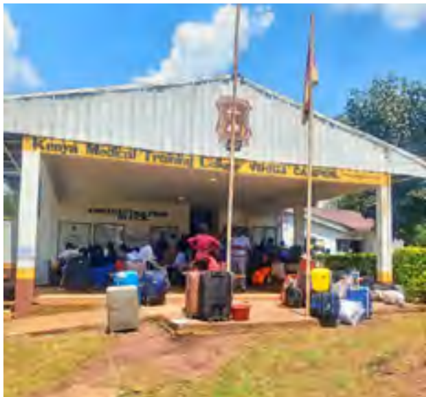
Parents, guardians and new students arrive at Vihiga Campus ahead of admissions.