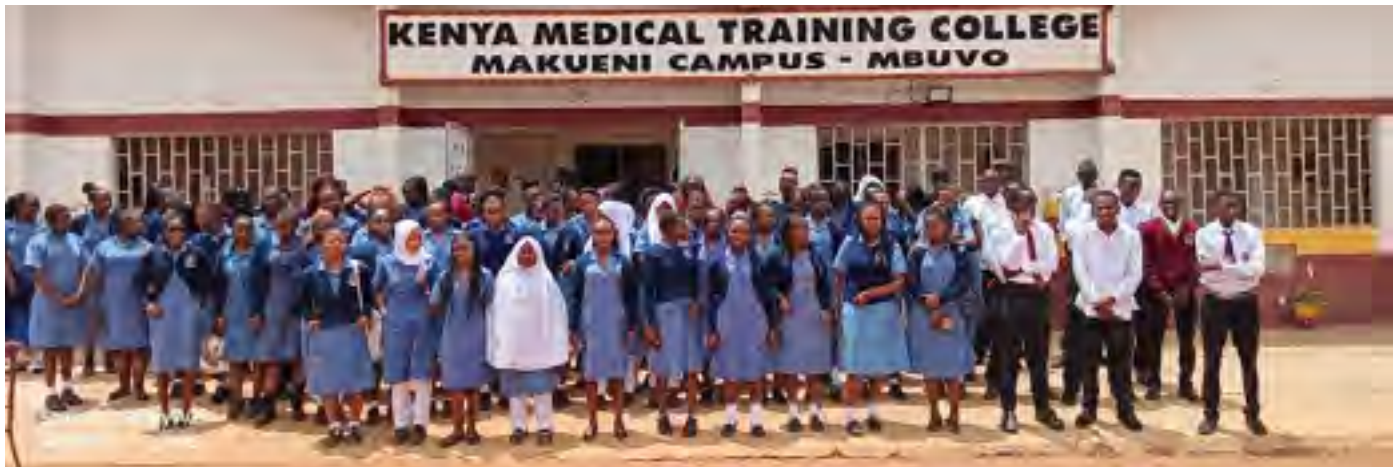
KMTc Makeni-Mbuvo satellite staff and new students during orientation.